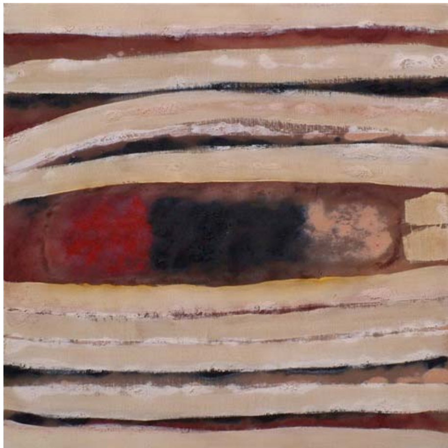
Karlbeedal (Hot coals of the fire) , (2011) resin, pigment & clay on hemp, 100 x 100cm