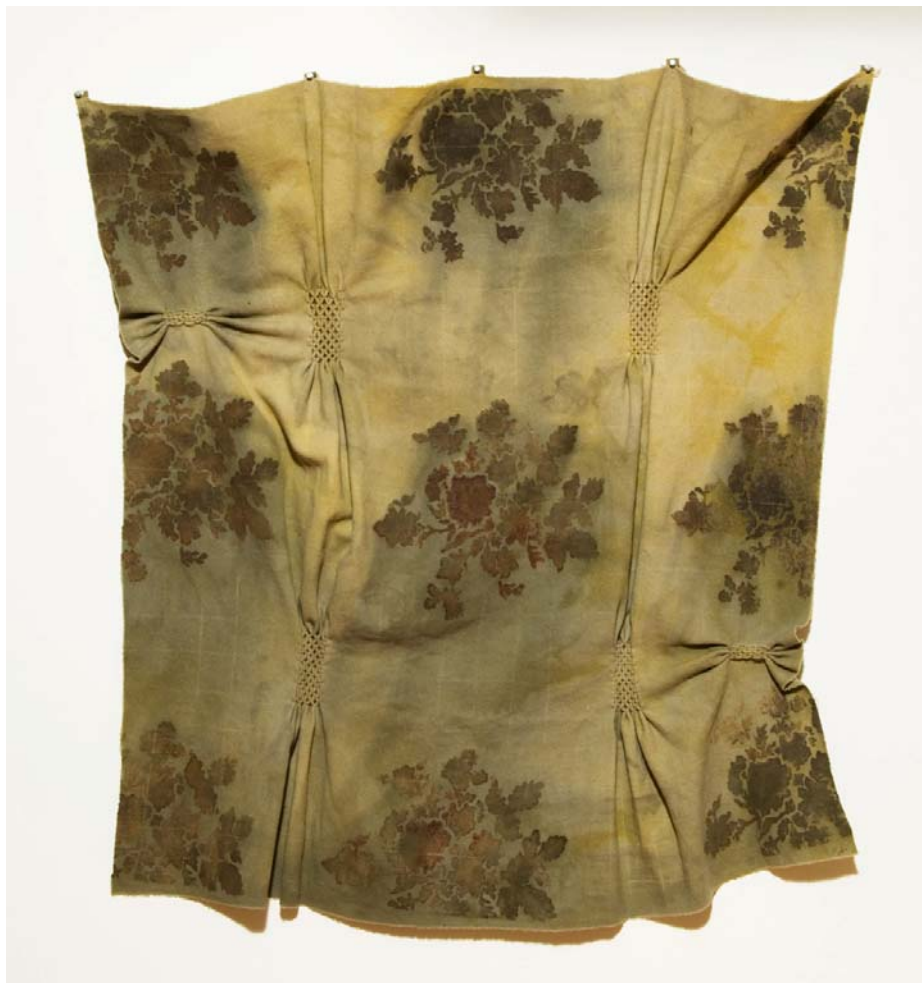
Map of the Swamp#2 (2008) plant dyed blanket, iron oxides, acrylic binder, tailor's chalk, silk thread, 114 cm h x 95cm w irregular