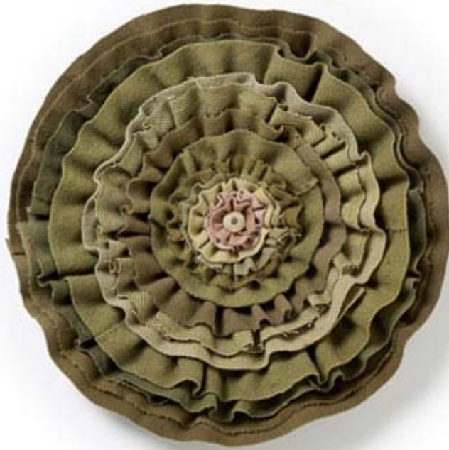
Green rosette (2009), found blankets, linen thread, embroidery hoop, plant dyes, found button, 39 x 39 x 5cm