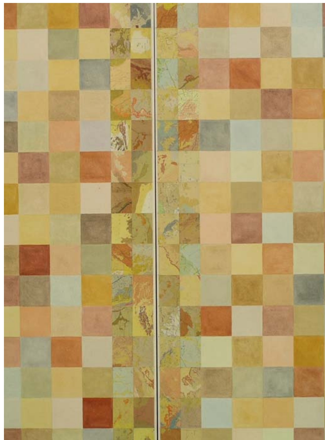
Transpose (2007-2008) original hand-coloured 1962 NT and WA geological maps, natural earth pigments and ground geophysical core samples on canvas, acrylic medium