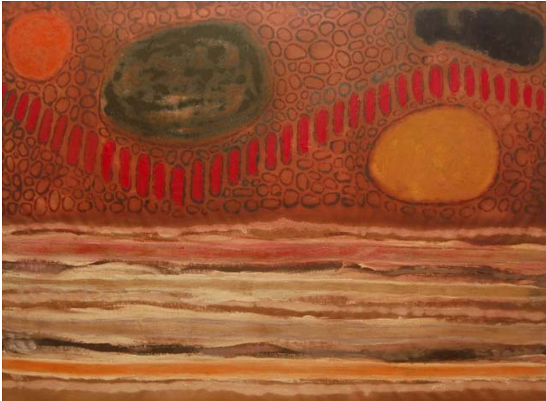
Moornong Boodja (My family my country out east,) (2010) resin, pigment & clay on hemp, 142 x 197cm