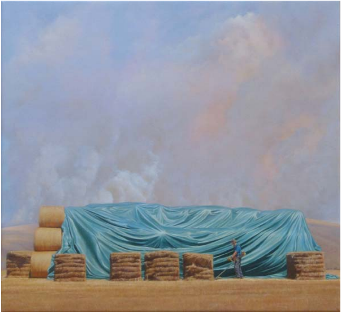
The Cutter (2010) oil on canvas, 61 x 66cm