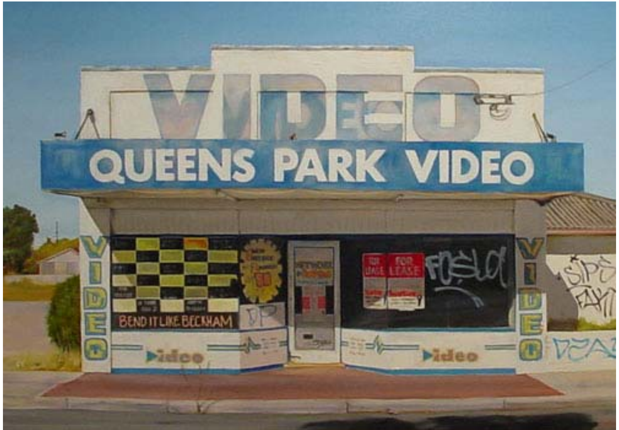
queens park video (2006) oil on linen