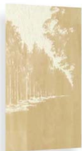
Cat 6. Vanishing Points (2010), engraved vinyl. Marri & Balga resin, painted MDF, 39 x 134.5 x 5.2 cm