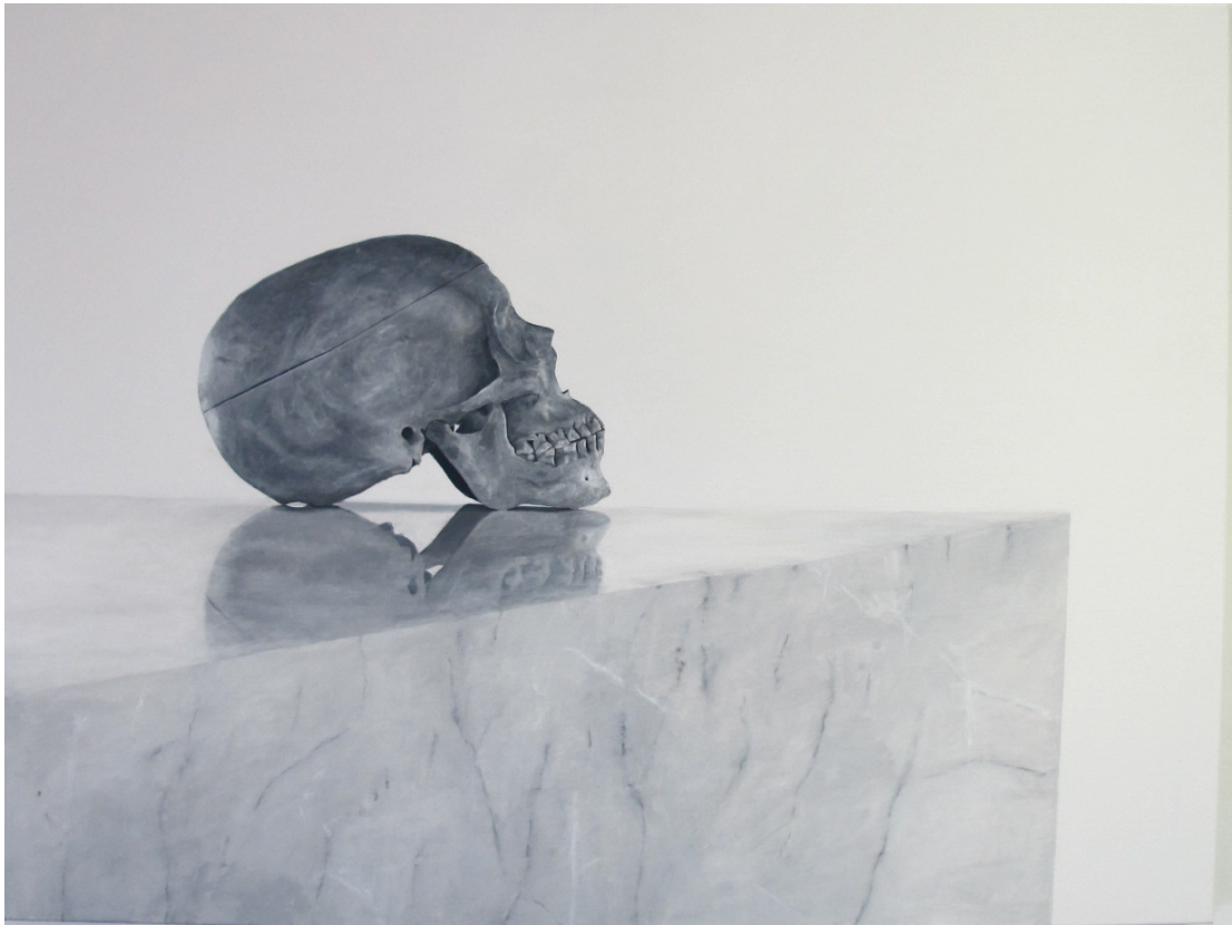
Skull on marble, (2010) oil on canvas, 120 x 80 cm