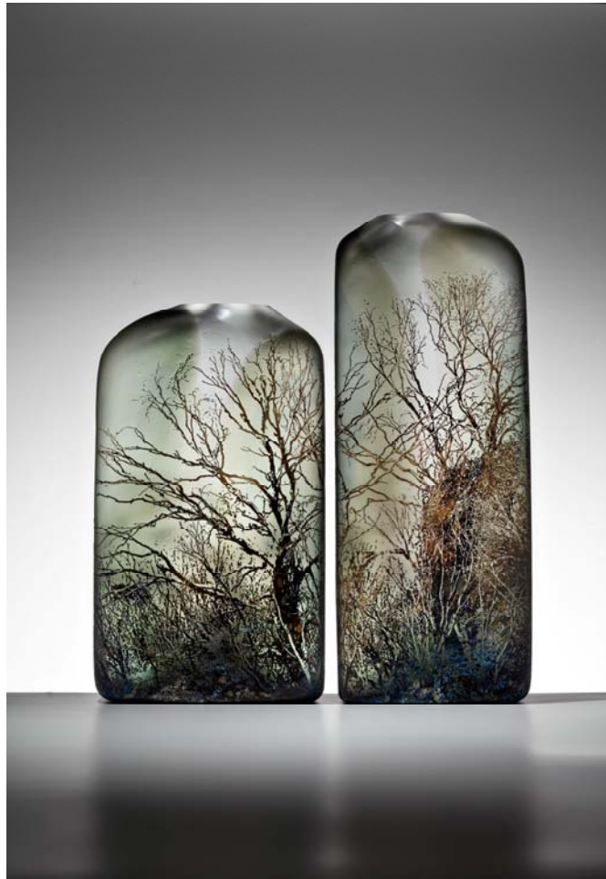
Deadhorse Gap Landscape Bottles (2010) blown glass with glass powder and metal leaf surfaces and sandblasted landscape imagery, 2pc set, sizes variable overall dimensions H58cm x L52cm x W10cm