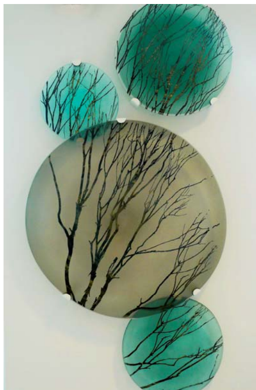
Canopy Commission for Apache Corporation (2009) blown glass with sandblasted tree branch imagery and metal fixings, 6p installation, H200cm x W100cm x D10cm. Level 9, 100 St Georges Tce, Perth, WA