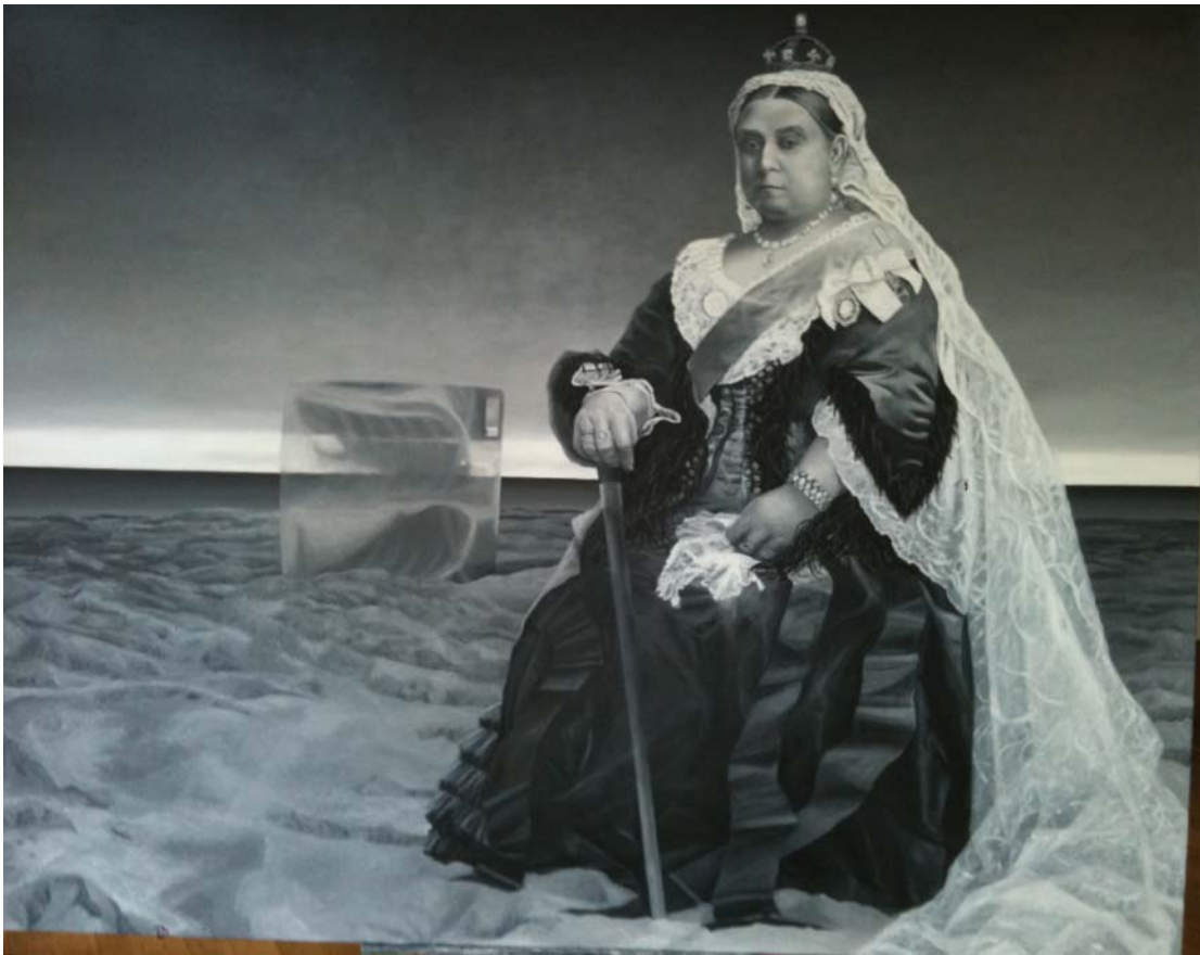
St Lubbock's Day 1871, (2010) oil on canvas, 155 x 190 cm