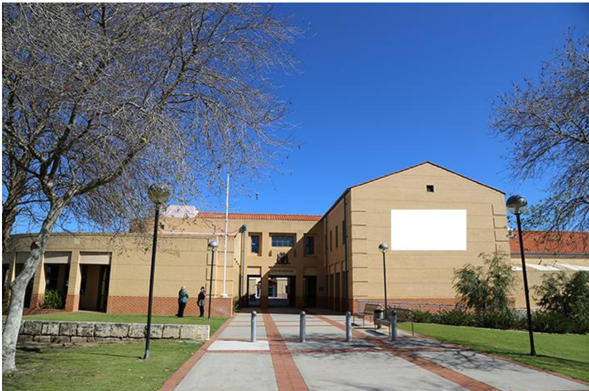
A wall-based custom billboard could be installed on the Courthouse east facing wall however a window would need to be permanently blocked off.