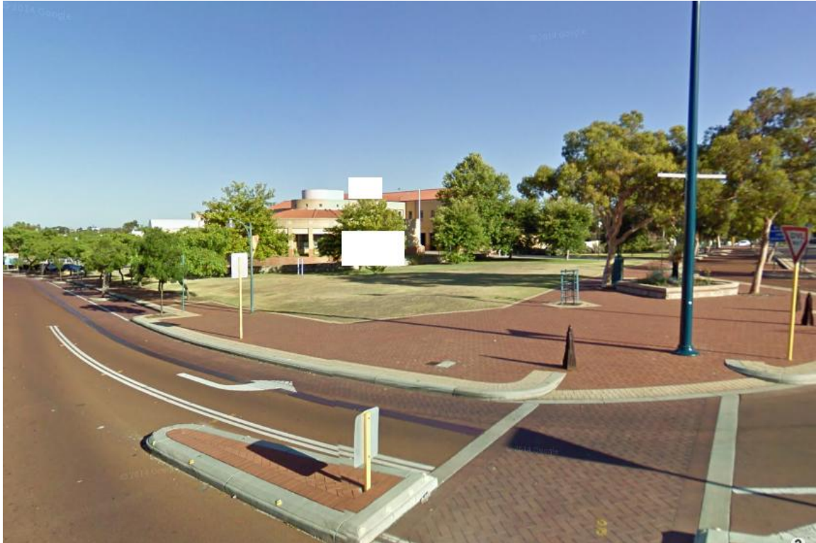
View of proposed billboard positions on the Courthouse front lawn and roof. Due to the nature of the building, a rooftop billboard would need to be custom built.