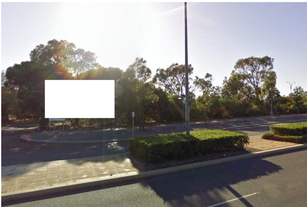
View of proposed billboard situated on north-west corner, facing north -west.