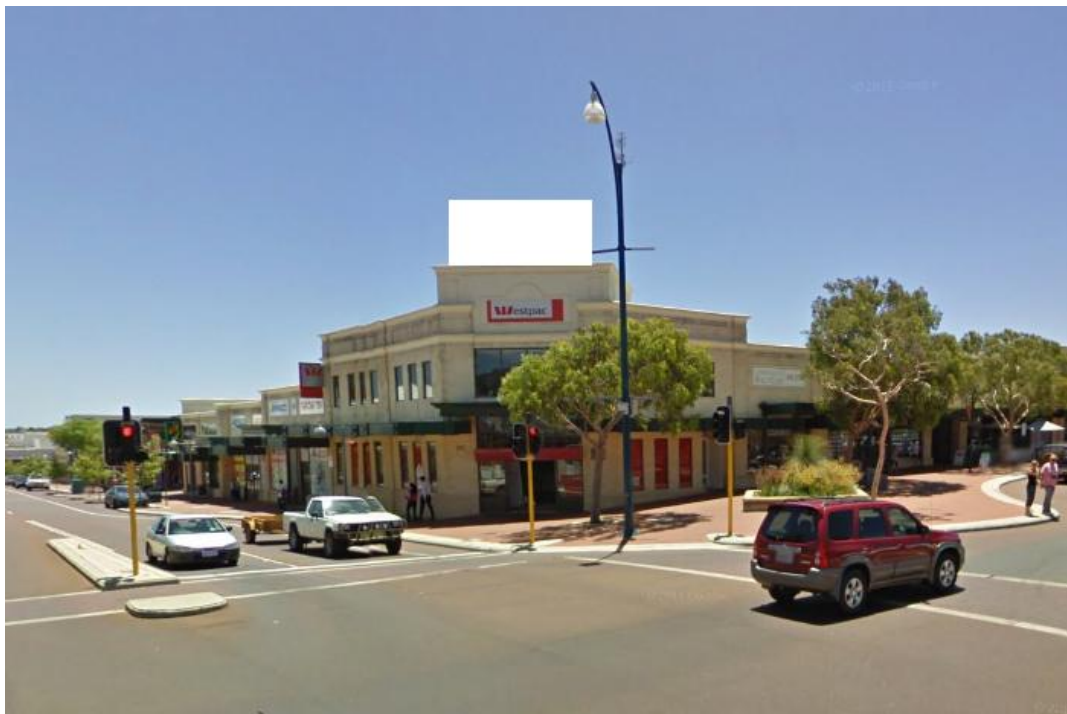
View of proposed billboard on the roof of 140 Grand Boulevard, above Westpac.