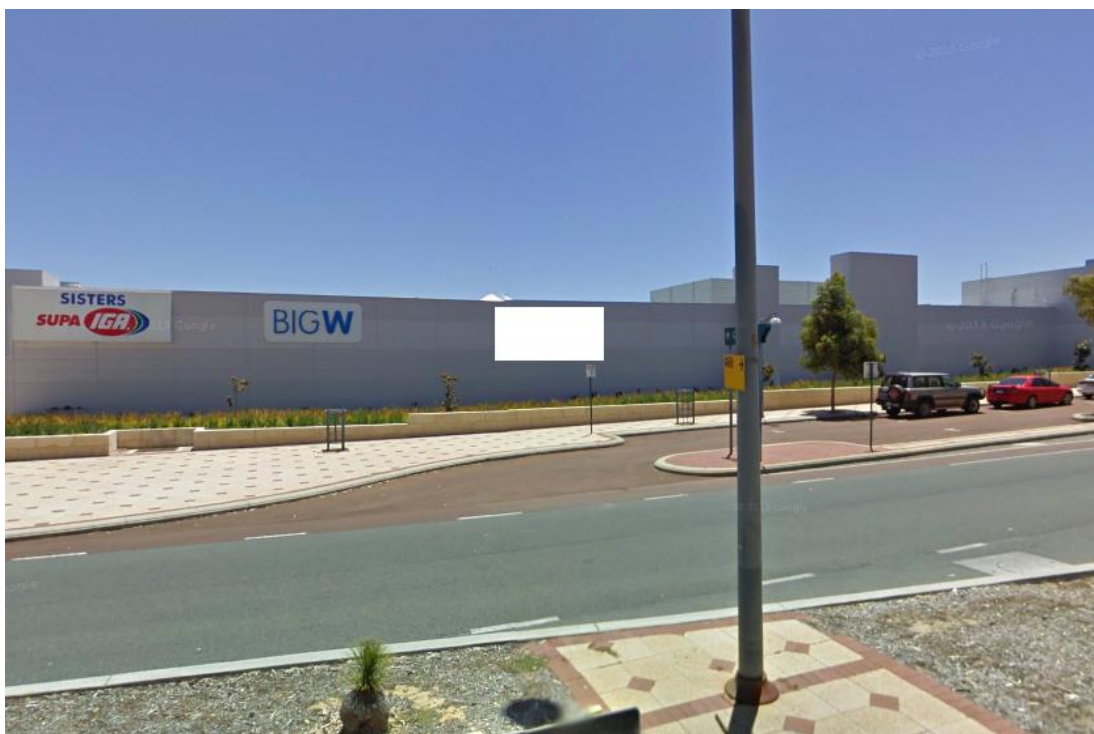
Proposed view of a wall mounted billboard on Lakeside Joondalup Shopping City building, facing east on Grand Boulevard.