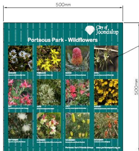
INTERPRETIVE SIGN SCALE: 1:50

8mm ALUMINIUM OR MILD STEEL PLATE POWDER COATED TEAL PM55473 CONCRETED A MIN OF 150mm BELOW GROUND