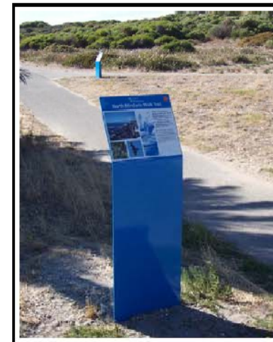
SAMPLE INTERPRETIVE SIGN NORTH MINDARIE WALK TRAIL

VINYL DIGITAL PRINT (STICKER ADHESIVE) OF INFORMATION FOR INTERPRETIVE SIGN WITH ANTI GRAFFITI FINISH