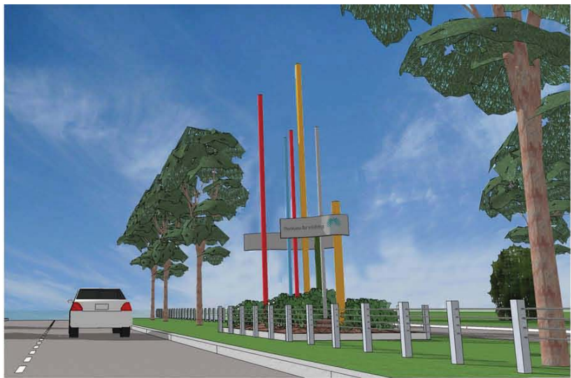
Travelling southwards on Marmion Avenue