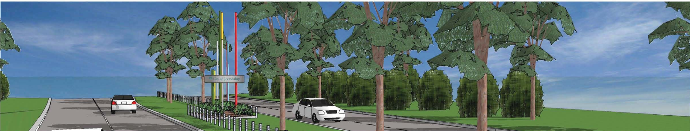
Travelling northwards on Marmion Avenue