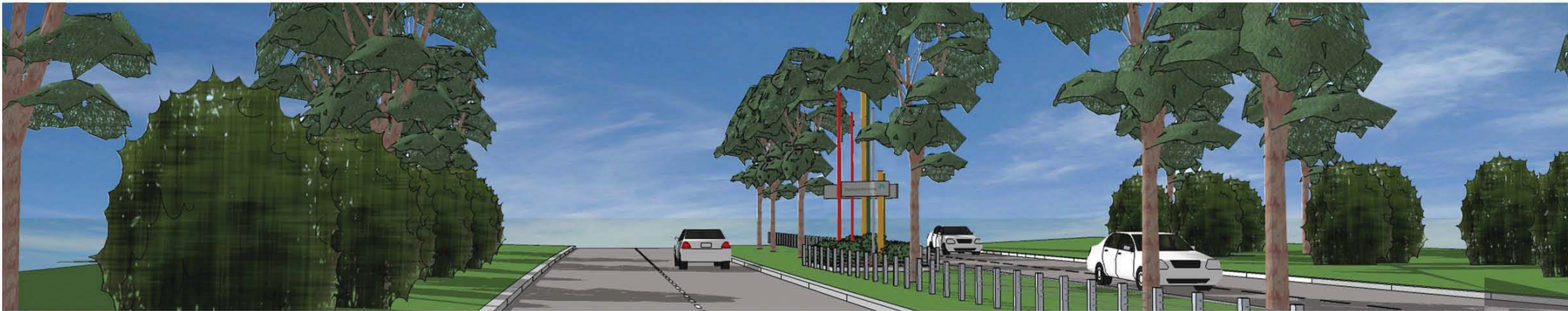
Travelling southwards on Marmion Avenue