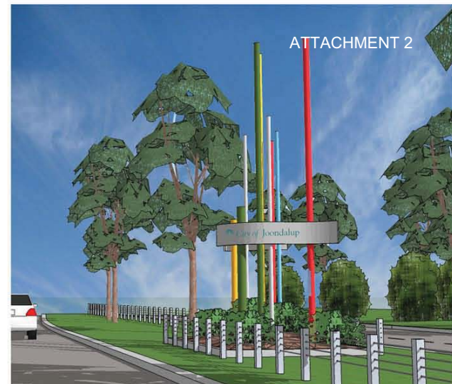
Travelling northwards on Marmion Avenue