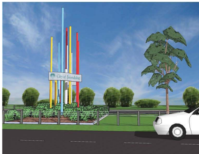
East view of entry sign