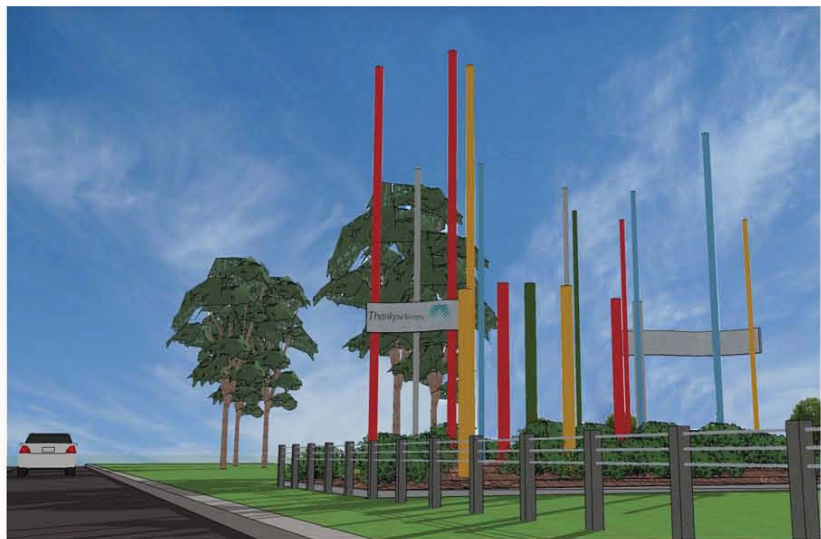
Travelling northwards on Marmion Avenue