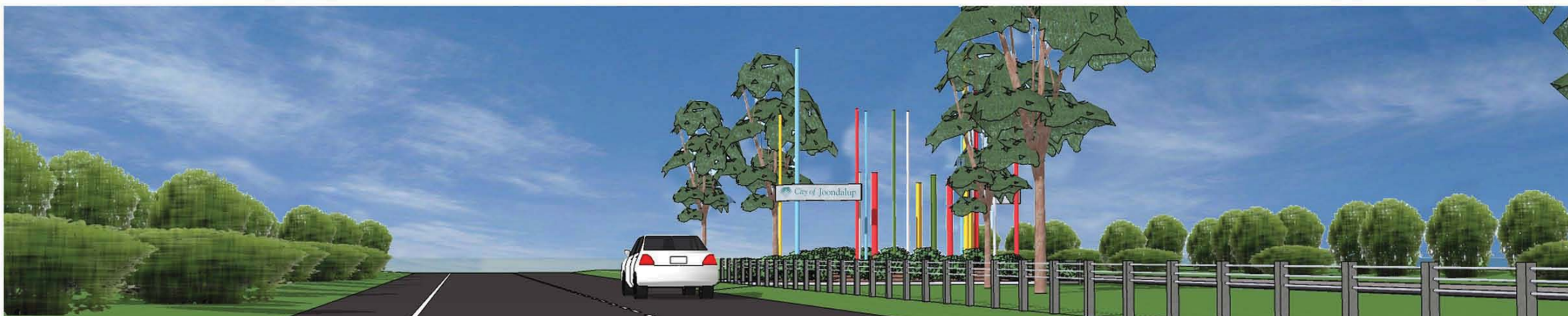
Travelling southwards on Marmion Avenue