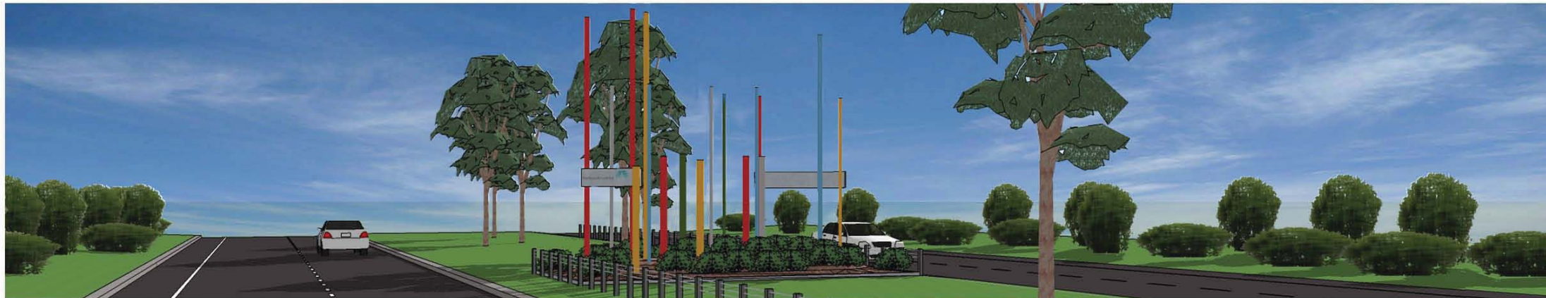
Travelling northwards on Marmion Avenue