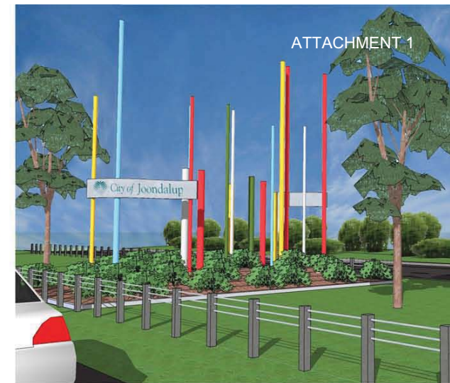
Travelling southwards on Marmion Avenue