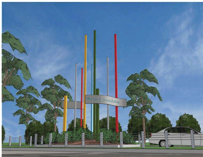
East view of entry sign