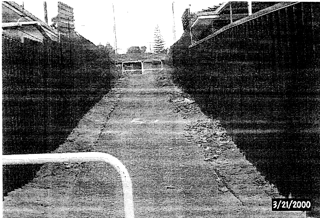
GREENWOOD VILLAGE SHOPPING CENTRE CAR PARK TO DERICOTE WAY