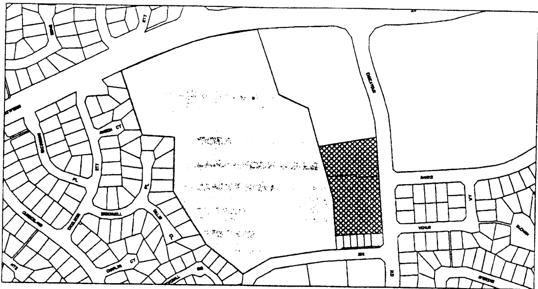
EXISTING ZONING - 'CIVIC & CULTURAL'