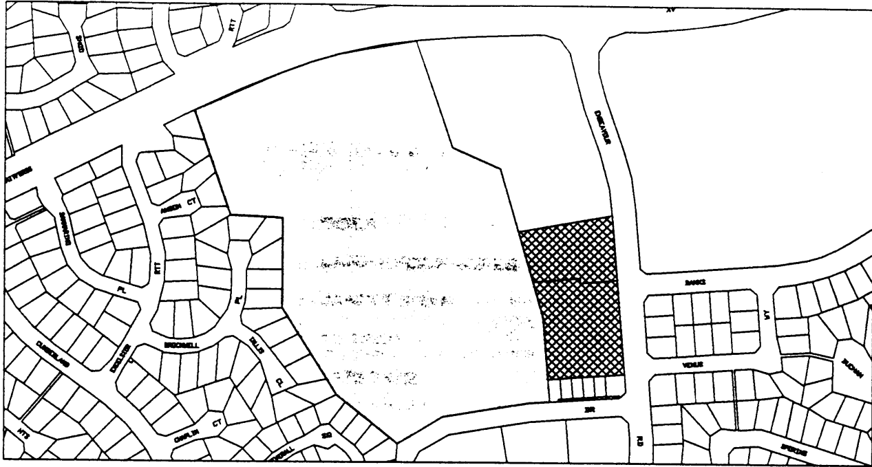
EXISTING ZONING - 'CIVIC & CULTURAL'