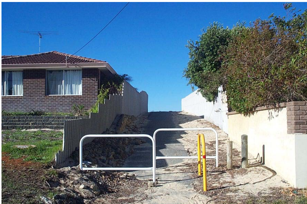
PHOTOGRAPH TAKEN FROM BRISBANE RESERVE END OF THE PEDESTRIAN ACCESSWAY