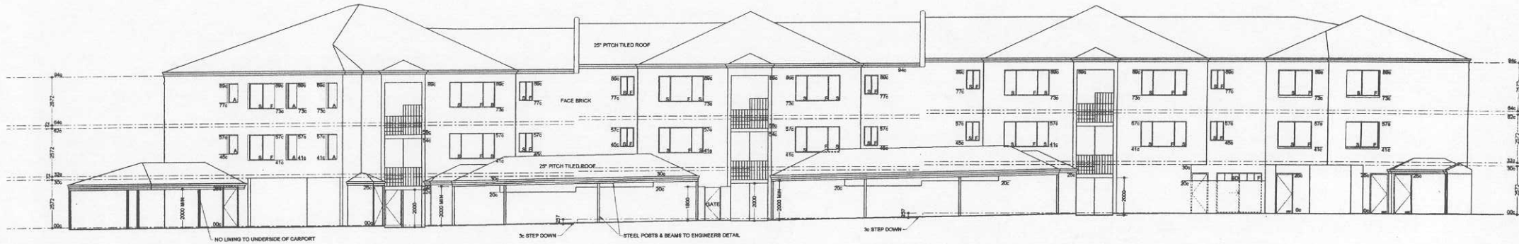
REAR ELEVATION 2