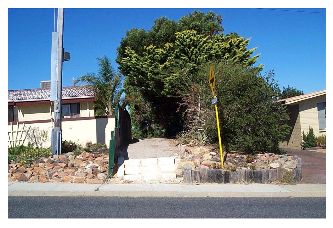
PHOTOGRAPH TAKEN THREE PROPERTIES BACK FROM CLIFF STREET TOWARDS THE NEW FOOTPATH TO INDICATE THE LEVELS OF THE LANEWAY AT THIS END