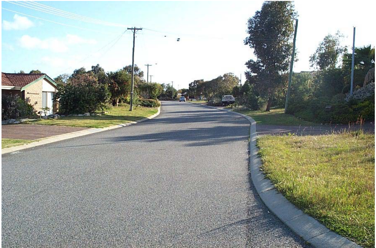
PHOTOGRAPH TAKEN FROM PATH LEADING TO FOOTBRIDGE UP ELLENDALE DRIVE, HEATHRIDGE