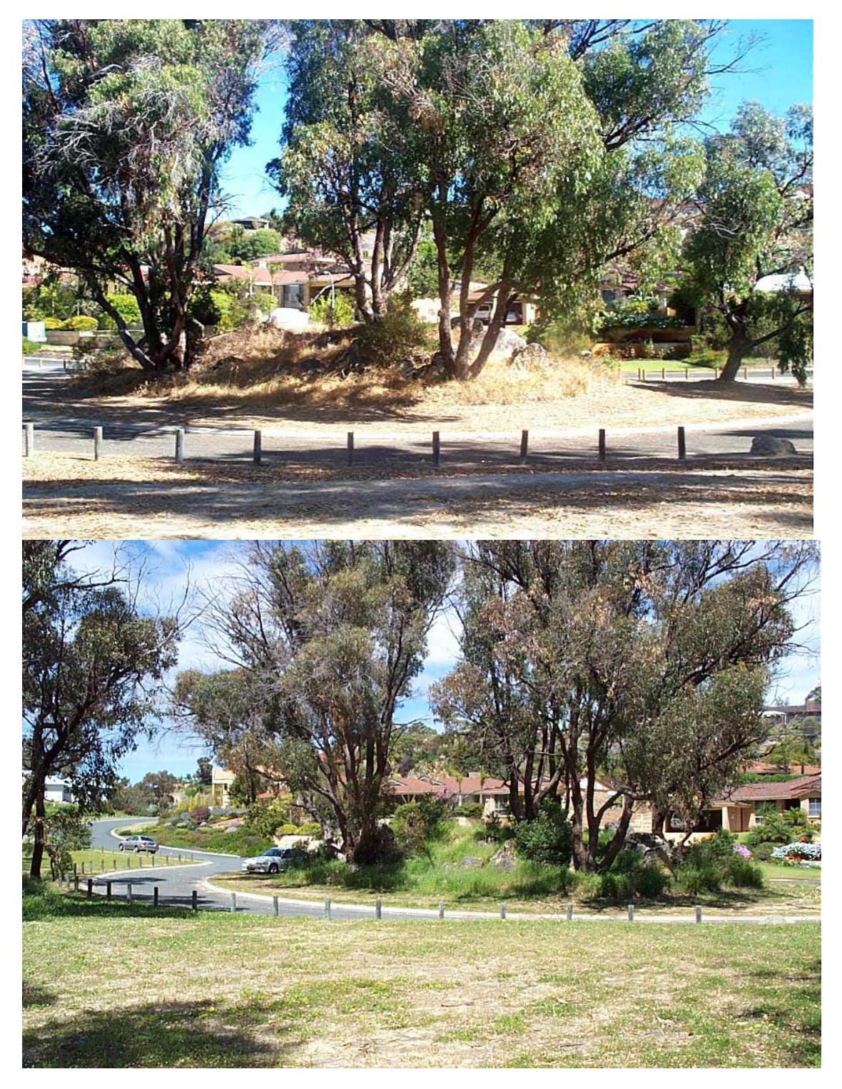
PHOTOGRAPHS OF PROPOSED CLOSURE OF QUARRY RAMBLE ROAD RESERVE