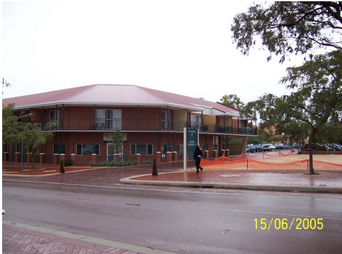
Photo 3: Mixed use commercial and group residential development on Reid Promenade across the road from subject lot.