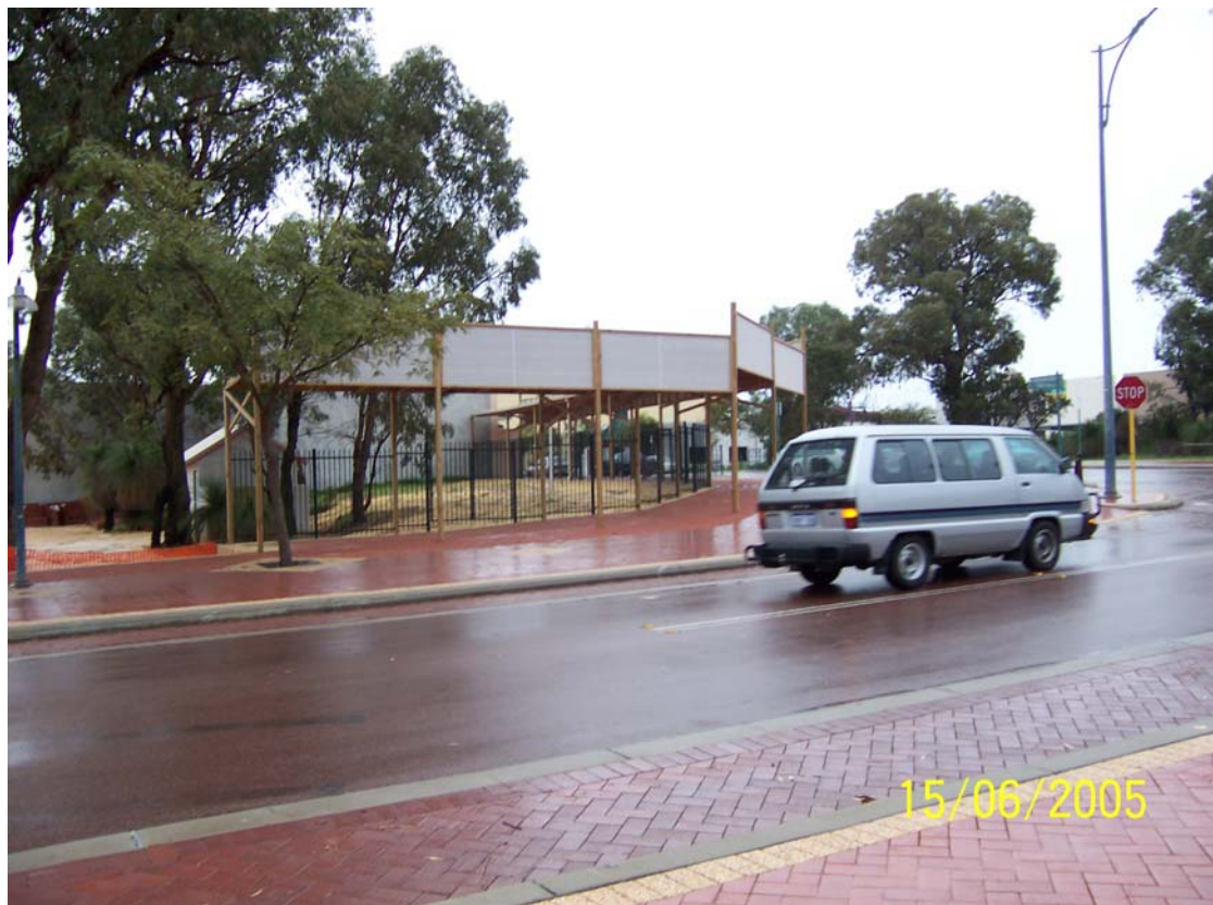
Photo 2: Taken from subject Lot 519 across the road to lot, which has a temporary approval to operate as a garden centre.