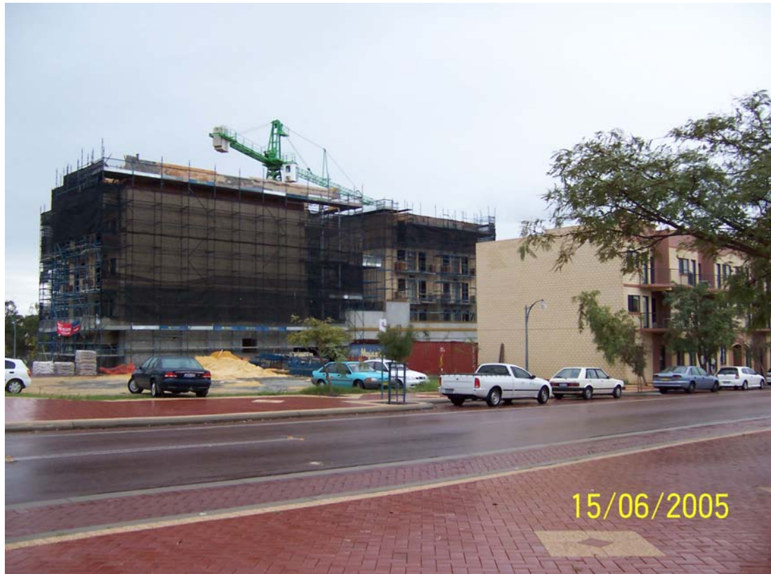
Photo 1: Corner Lot 519 looking north toward 4 storey mixed use development currently under construction and 3 storey multiple unit development to the east of the site.