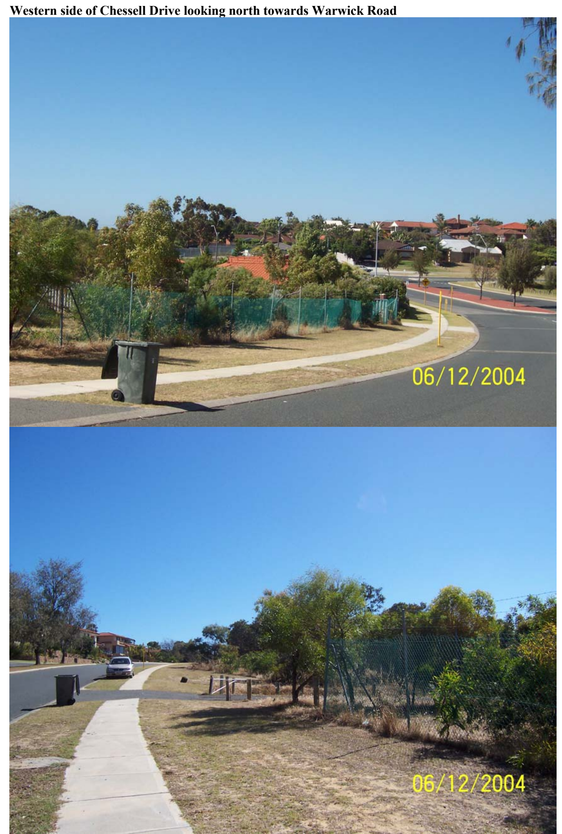
Western side of Chessell Drive looking south