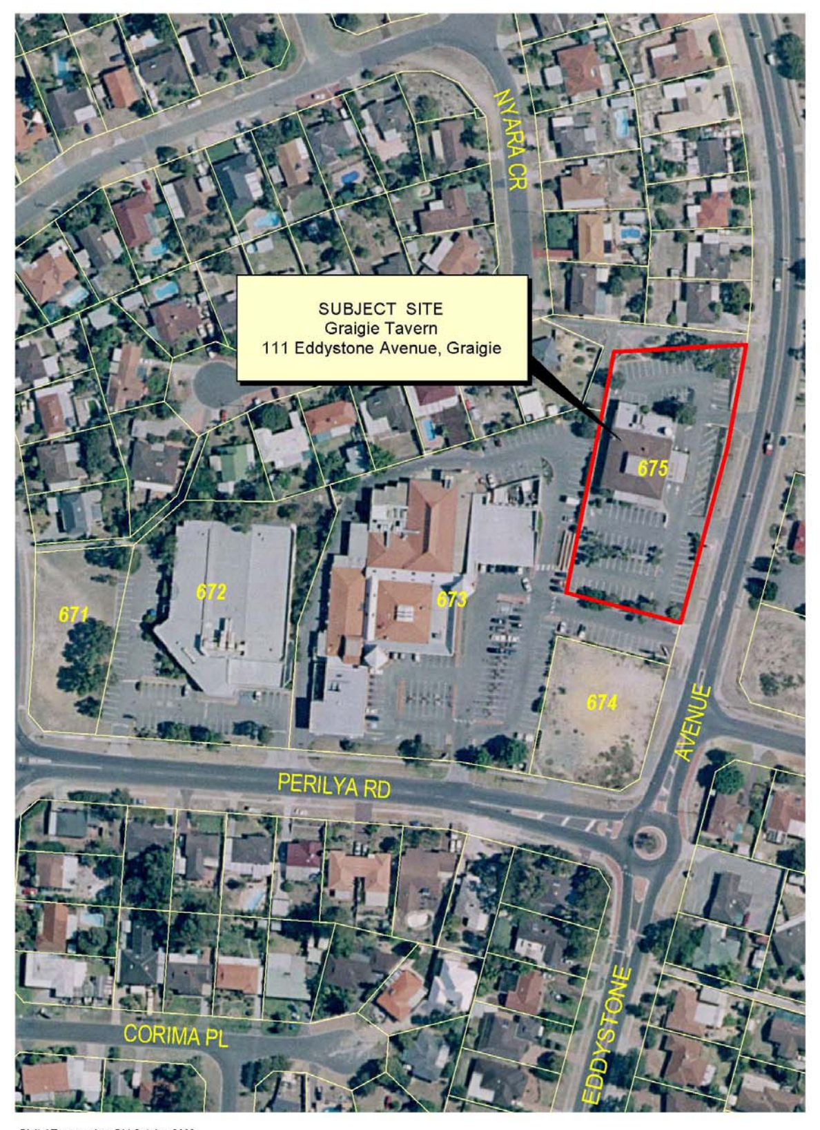
Digital Topography : DLI October 2002 Digital Photography : DLI December 2004 Prepared by City of Joondalup : Urban Design & Policy, Cartograohic Section. 14/11/2005 - djt