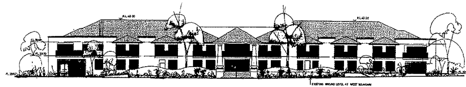
WEST ELEVATION (WOODLAKE RETREAT)

MONTAGUE GRANT ARCHITECTS PTY LTD 24 BRISBANE ST, PERTH WA 6000 TELEPHONE: 9228 2233 FAX: 9227 6346 A.C.N. 009 072 593 DRAWING: ELEVATIONS JOB NO: 02.27 DATE: DEC 2005 CLIENT: ASSS AGED CARE GROUP PTY LTD DRAWN: VC JOB: NEW AGED CARE FACILITY SCALE: 1:200 SITE: LOT 550 WOODLAKE RETREAT KINGSLEY CITY OF KOOBALLEE THIS DRAWING IS THE COPYRIGHT OF MONTAGUE GRANT ARCHITECTS PTY LTD EXCLUSIVELY