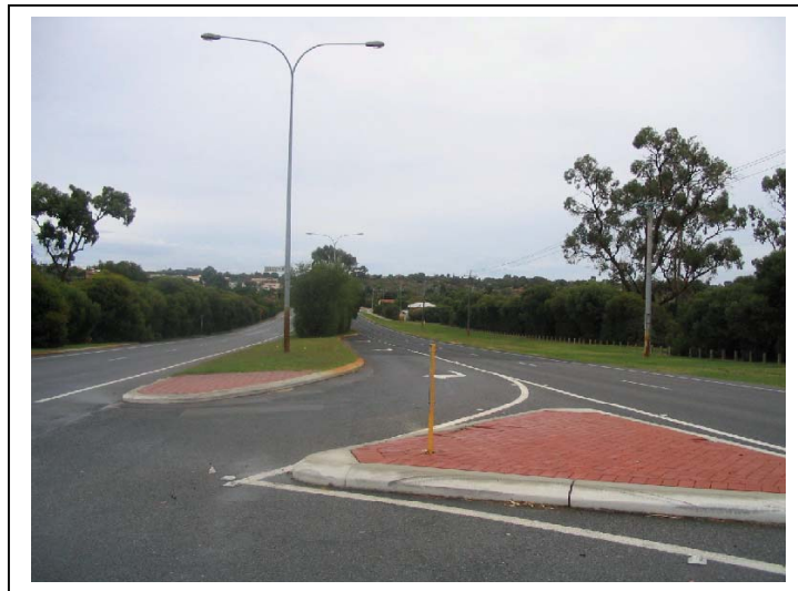
Typical "Seagull" island treatment

A preliminary investigation shows that it is likely that no changes would be required to the existing kerb lines.