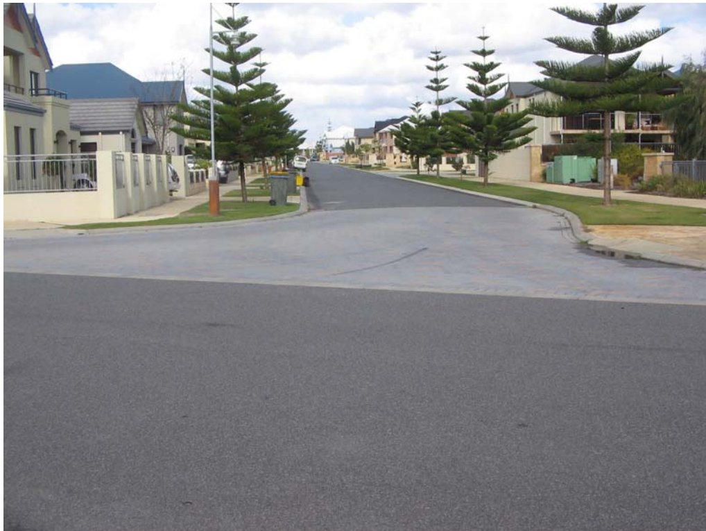
Amalfi Drive , Hillarys looking south from Marbella Drive