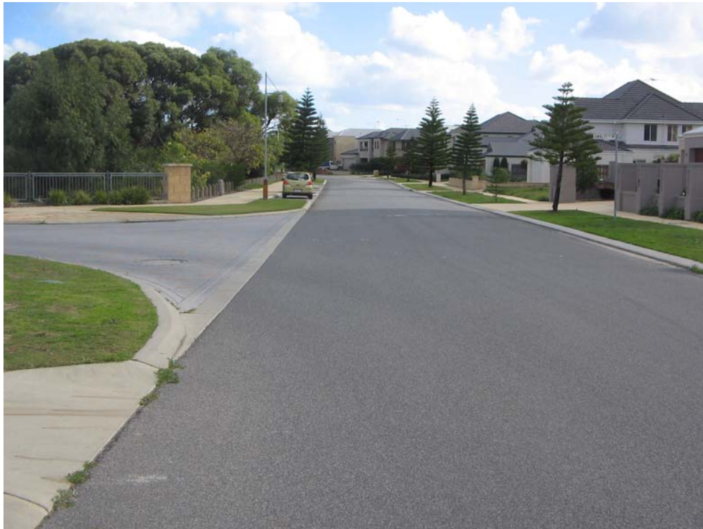
Marbella Drive, Hillarys Looking westward