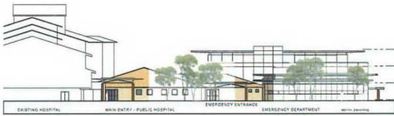
WEST ELEVATION (MAIN ENTRY AND EMERGENCY DEPARTMENT)