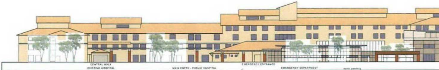
PART SOUTH ELEVATION - SHENTON AVENUE (MAIN ENTRY AND EMERGENCY DEPARTMENT)