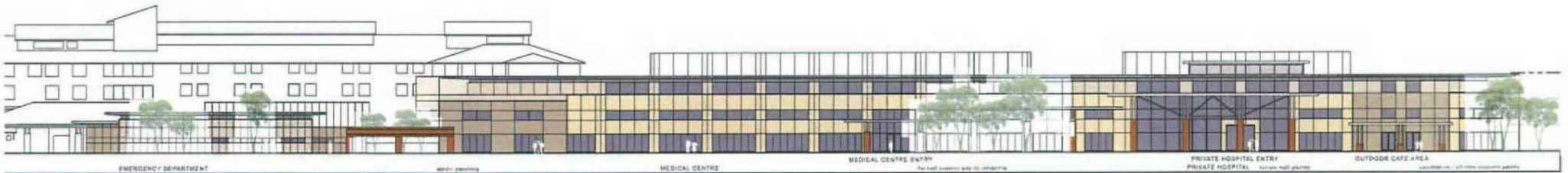
PART SOUTH ELEVATION - SHENTON AVENUE (MEDICAL CENTRE AND PRIVATE HOSPITAL)