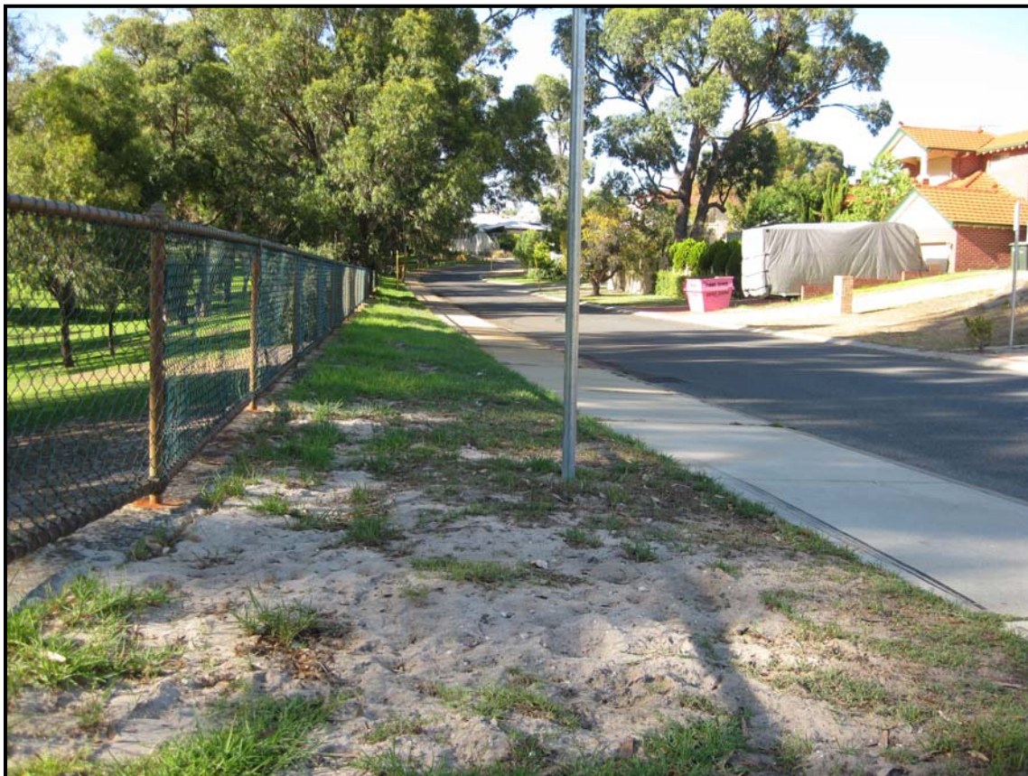
Newport Gardens – street verge