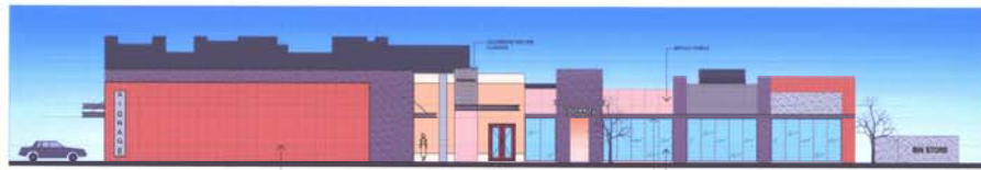
SOUTH ELEVATION (CARPARK VIEW) SCALE 1:100