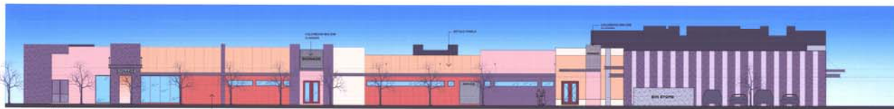
EAST ELEVATION (CARPARK VIEW) SCALE 1:100