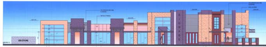
NORTH ELEVATION (HOBSONS GATE) SCALE 1:100