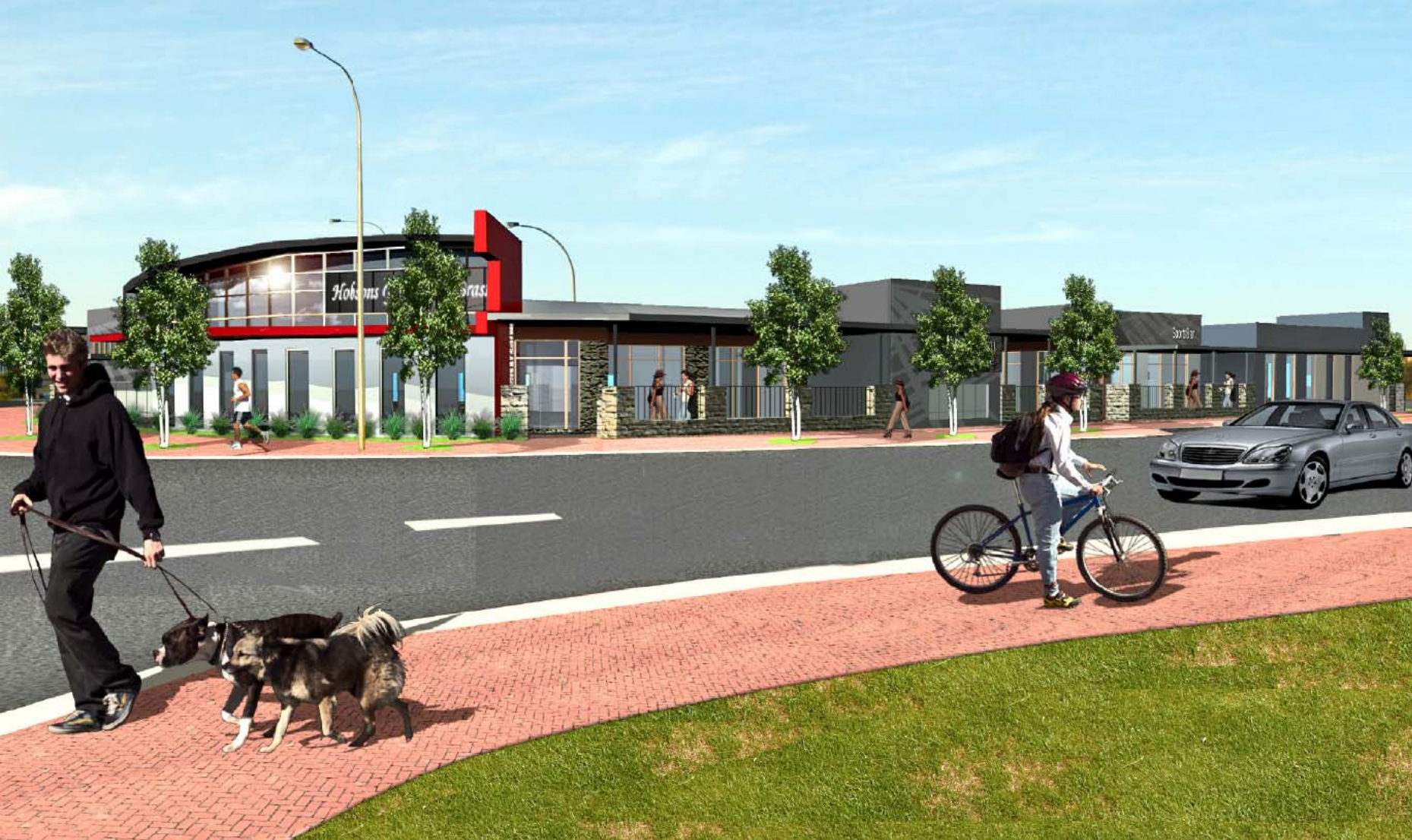
Figure 2 - View from Chesapeake Way