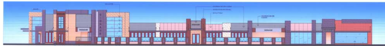
WEST ELEVATION (CHESAPEAKE WAY) SCALE 1:100