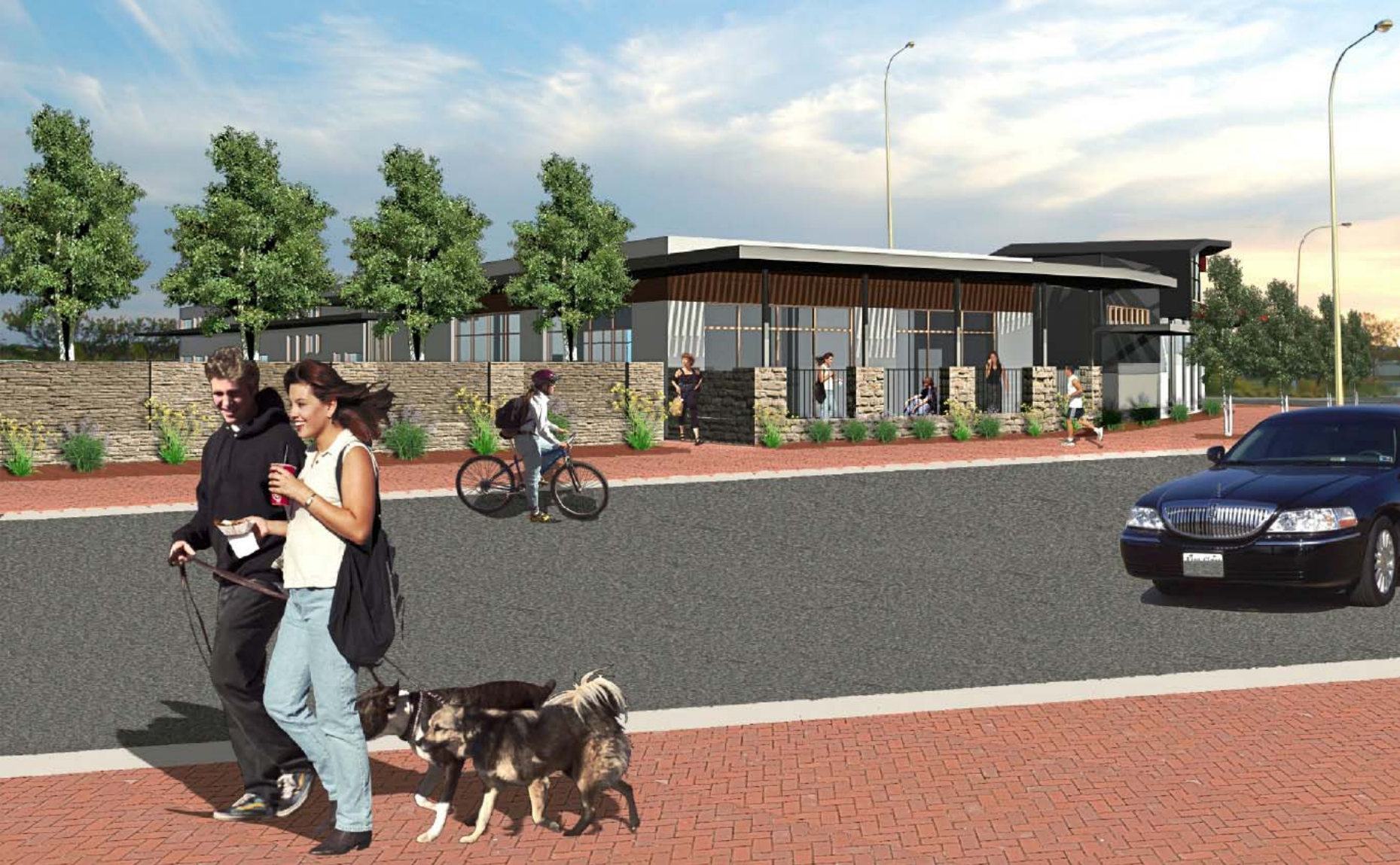
Figure 3 - View from Hobsons Gate