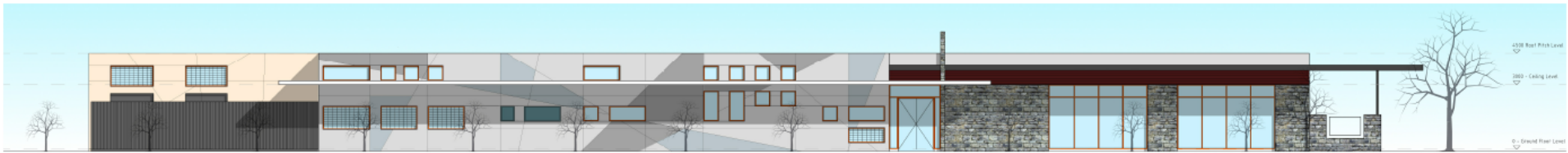
East Elevation Scale 1/8" = 1'-0"