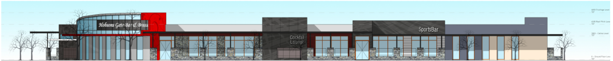
West (Chesapeake way) Elevation Scale 1/8" = 1'-0"