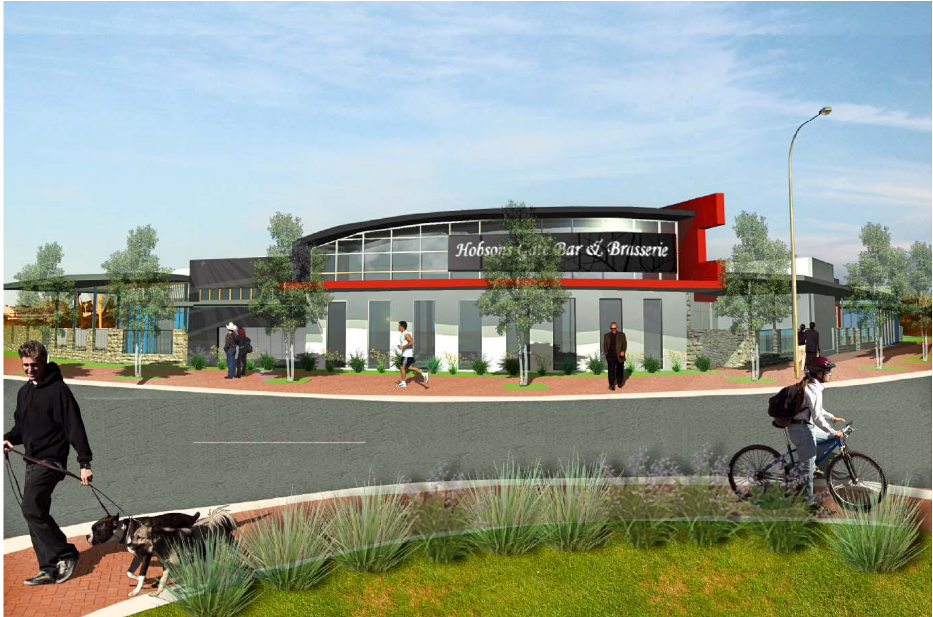
Figure 1 - View from corner of Hobsons Gate and Chesapeake Way