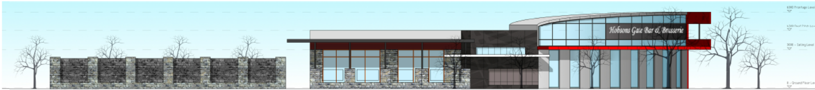
North Elevation Scale 1/8" = 1'-0"