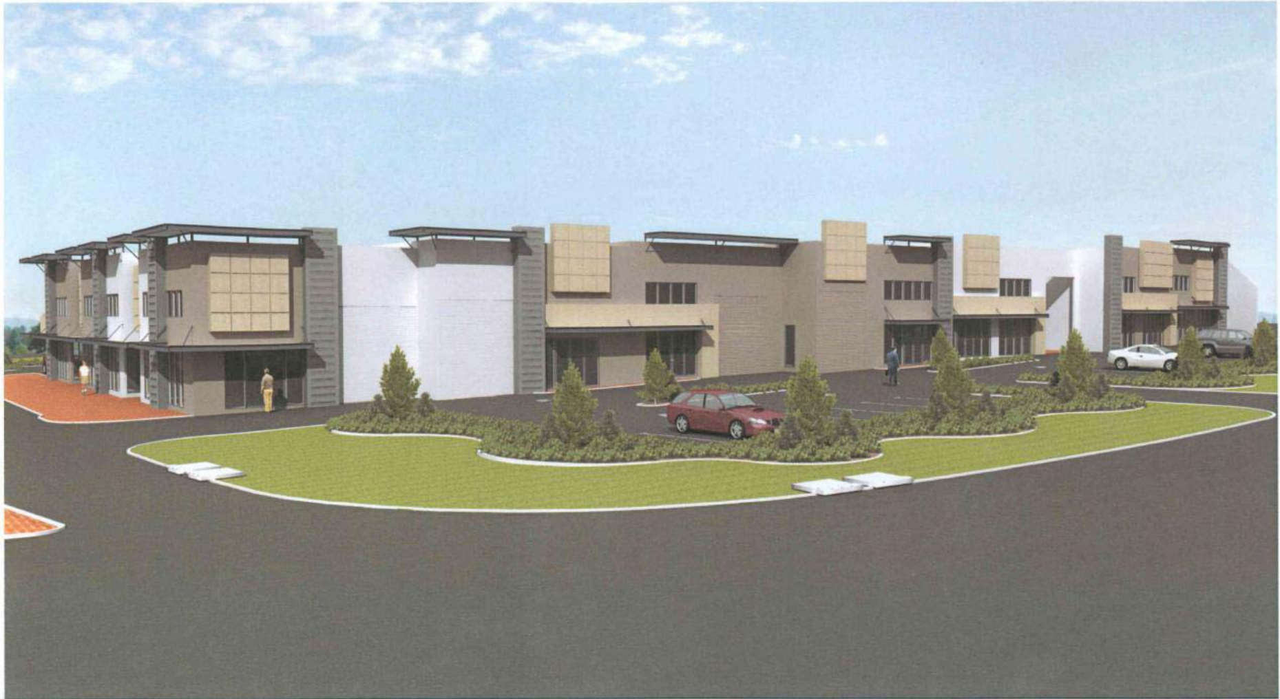
Figure 3 - View of Proposed Development from corner Hobsons Gate and Chesapeake Way.