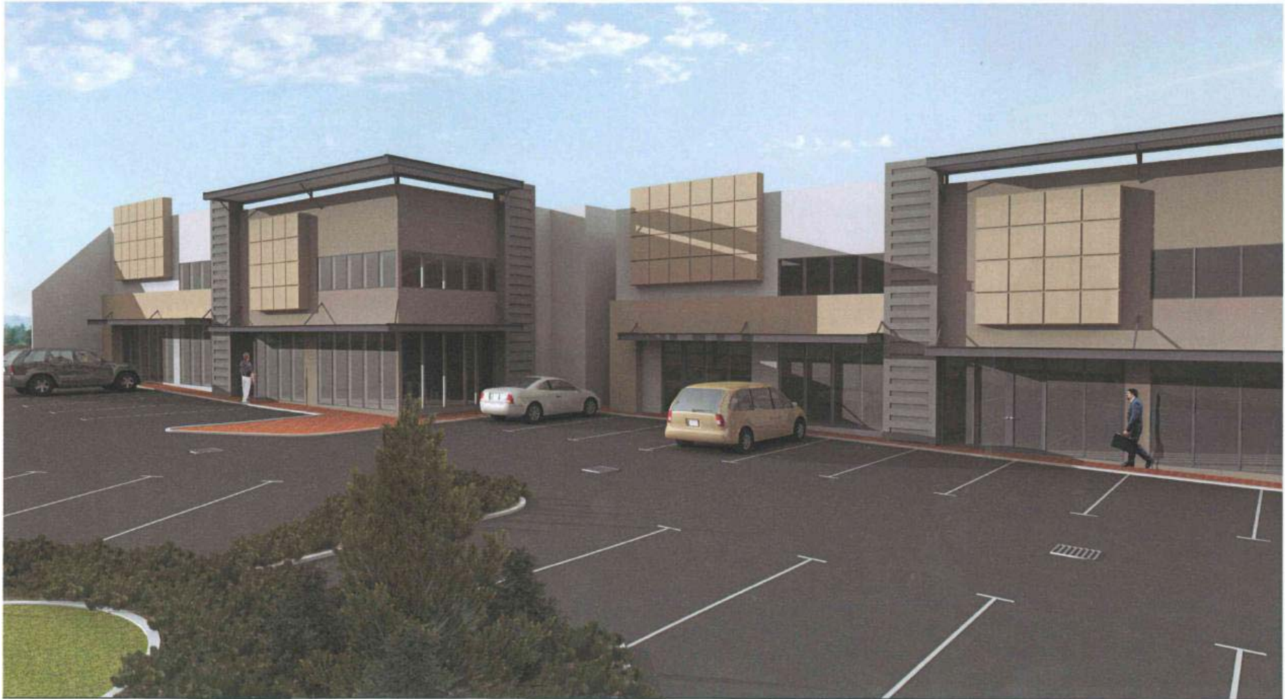
Figure 2 - View of Proposed Development from Marmion Ave.