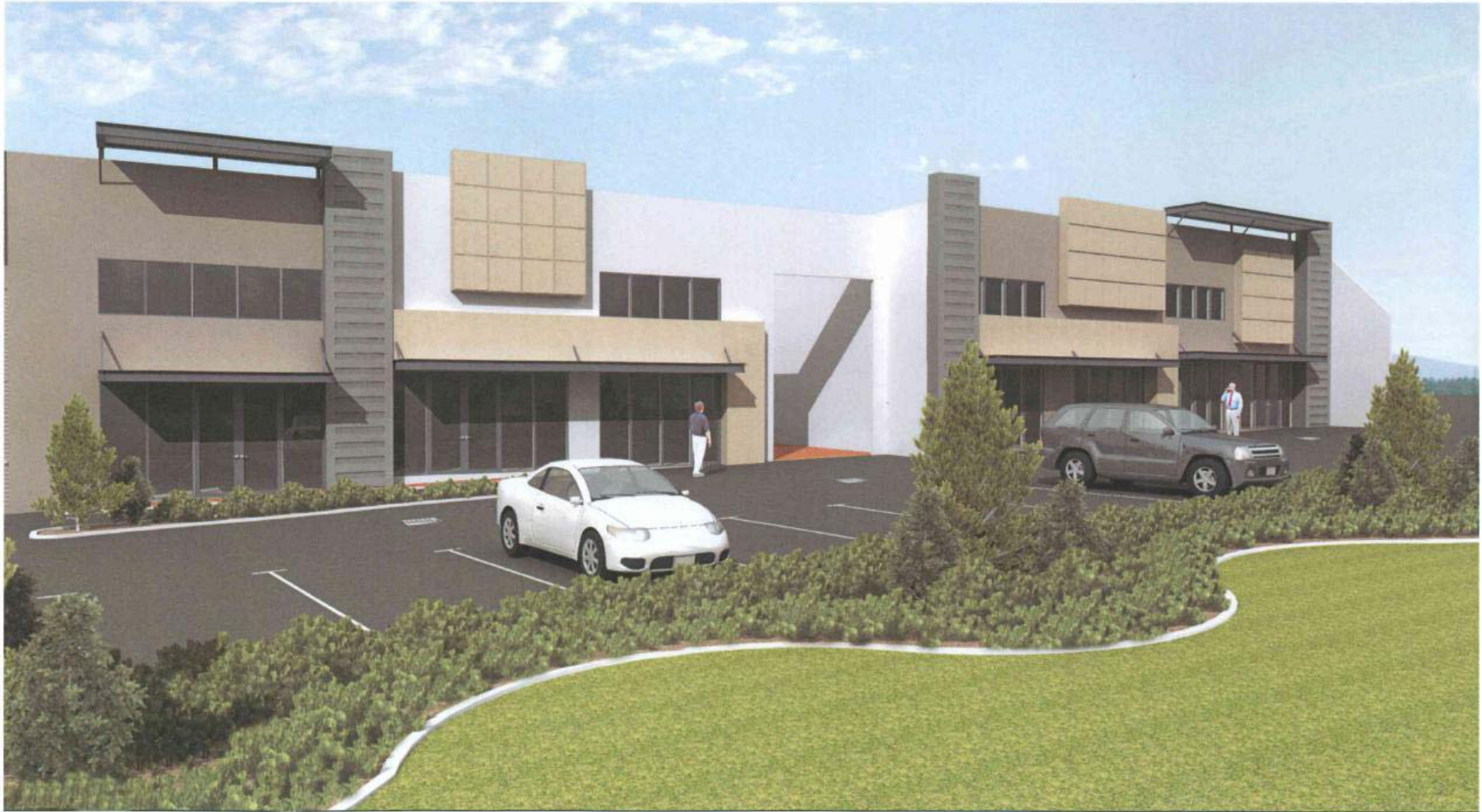
Figure 5 - View of Proposed Development from Chesapeake Way.