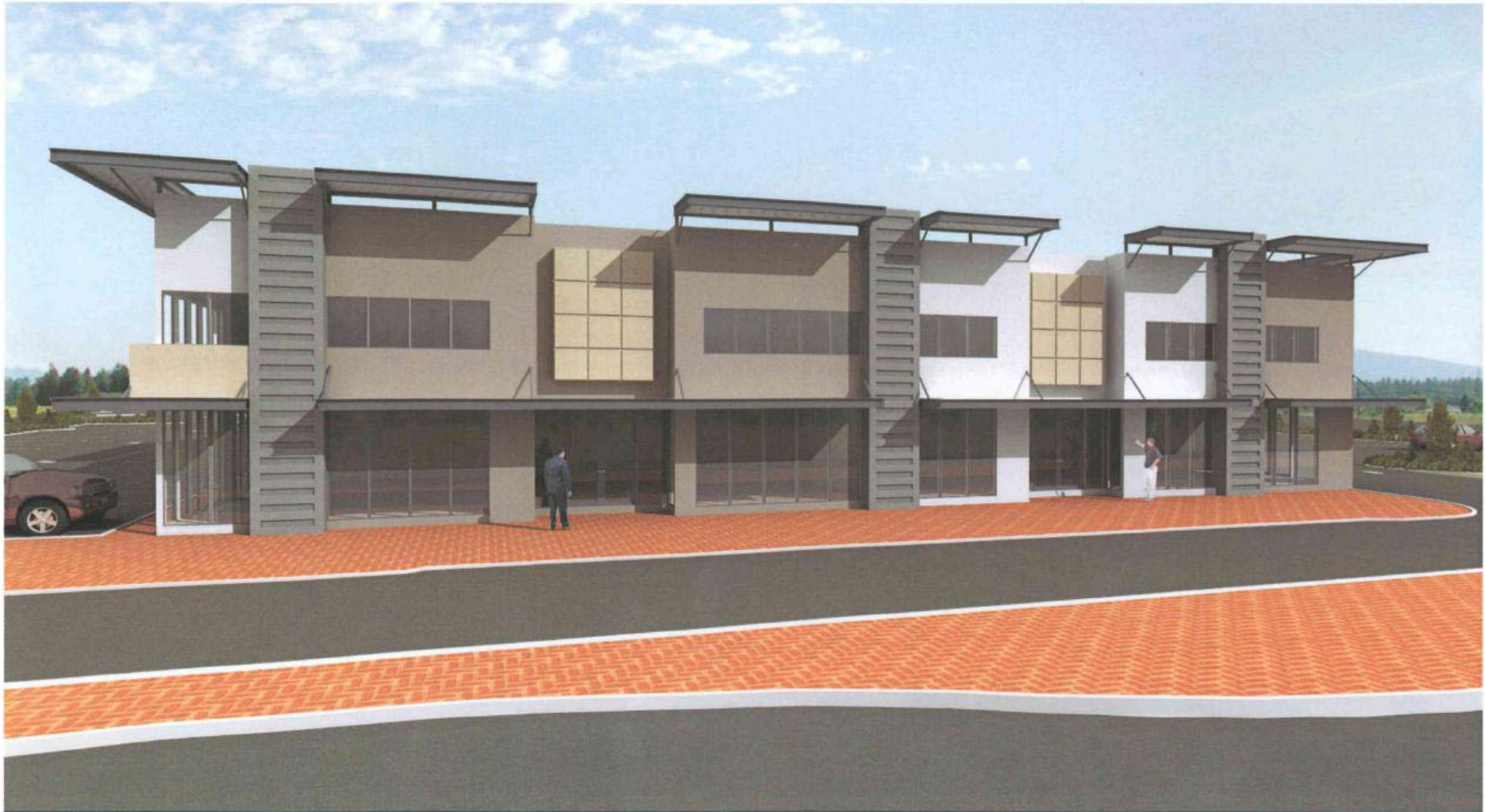
Figure 4 - View of Proposed Development from Hobsons Gate.