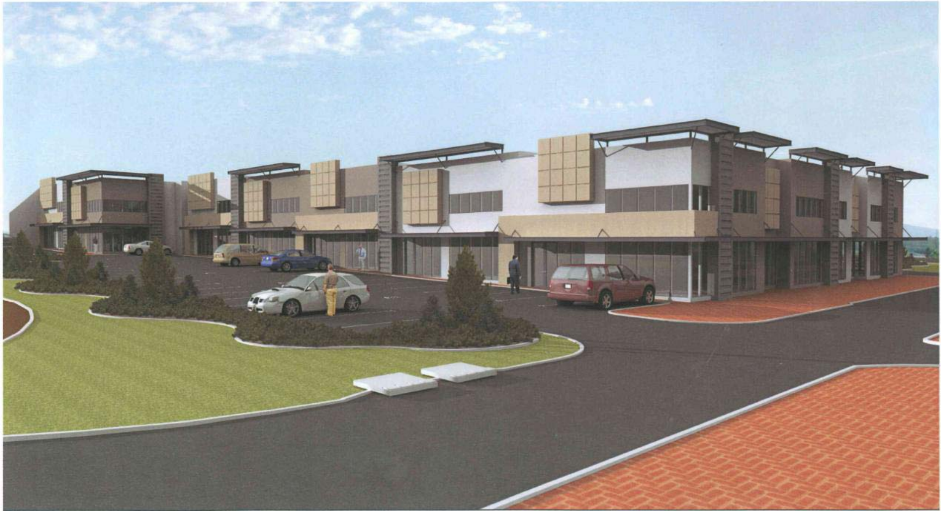
Figure 1 - View of Proposed Development from Hobsons Gate.