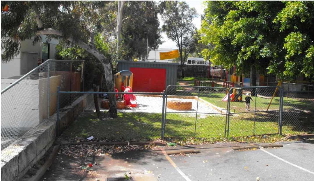
Image 1: Existing sand pit over which the proposed shade sail is to be located.