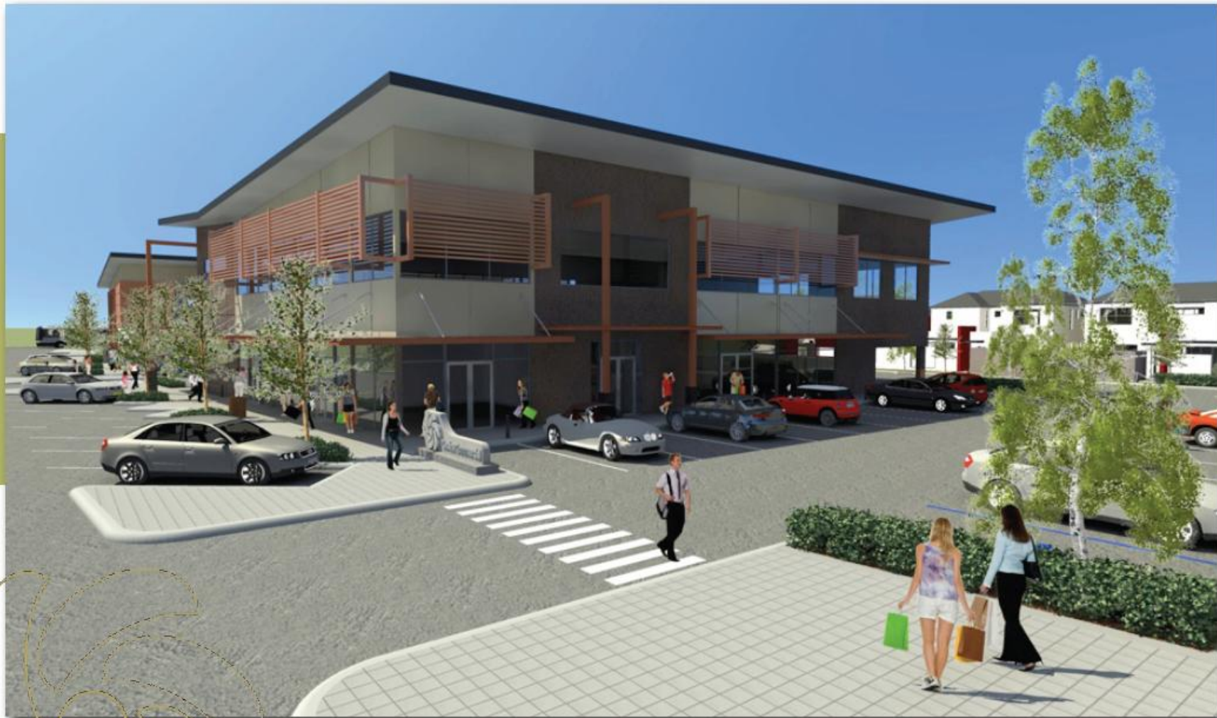
View 02 - Chesapeake Way, (Entrance 2)