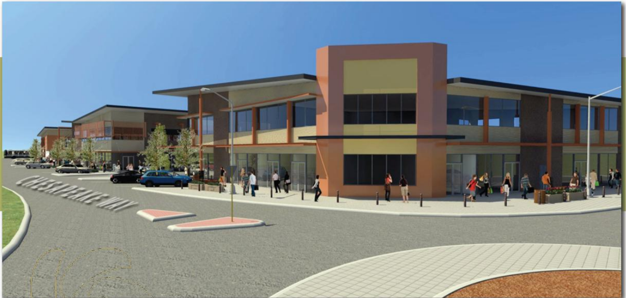
View 01 - Chesapeake Way & Hobsons Gate