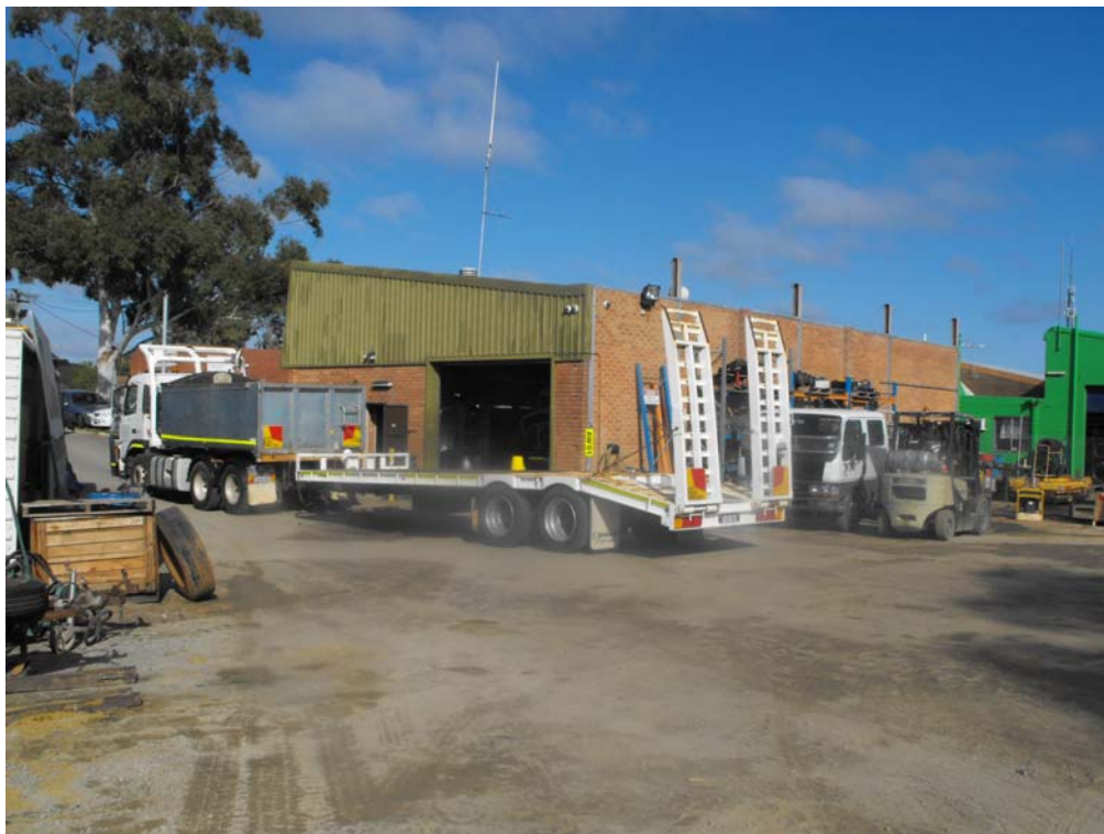
Photo 3 – Proposed storage shed location to rear of existing building