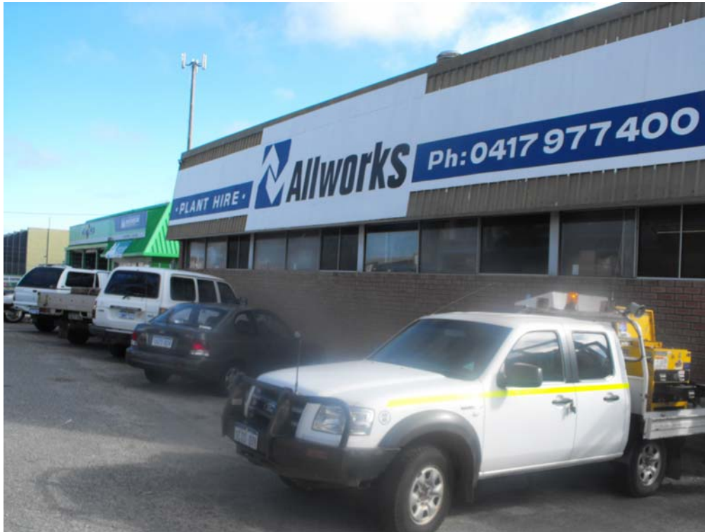
Photo 1 – Front facade as viewed from Canham Way. Existing signage subject of this approval.