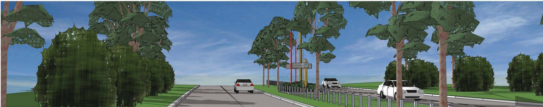
Travelling southwards on Marmion Avenue