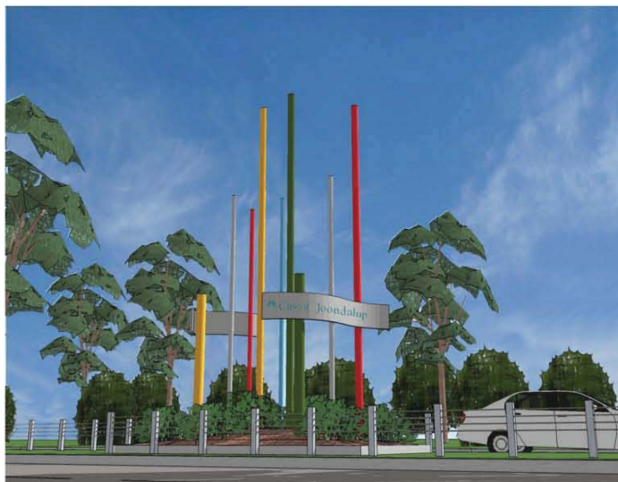
East view of entry sign