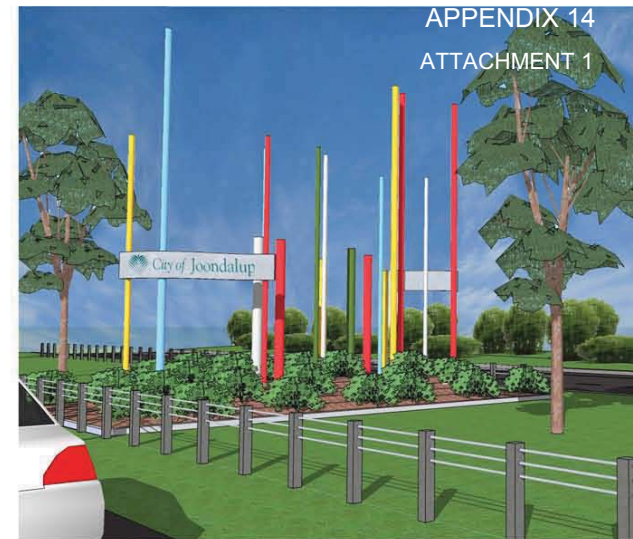
Travelling southwards on Marmion Avenue