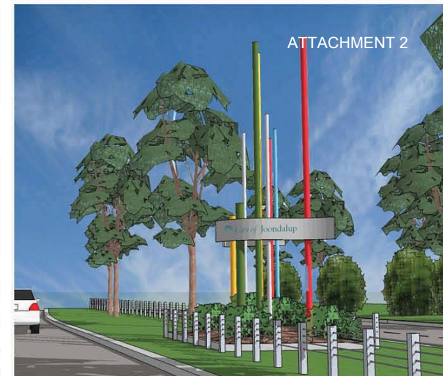
Travelling northwards on Marmion Avenue