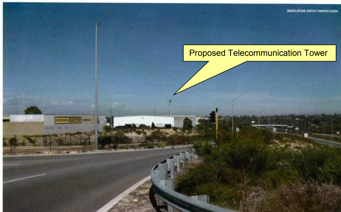
VIEW 2 – FROM SOUTH BOUND FREEWAY ON RAMP, PROPOSED BUILT FORM

DATE: 08.05.2013 DWG NO: 001 CONNOLLY TELCO SITE REV: A SCALE: 1:100