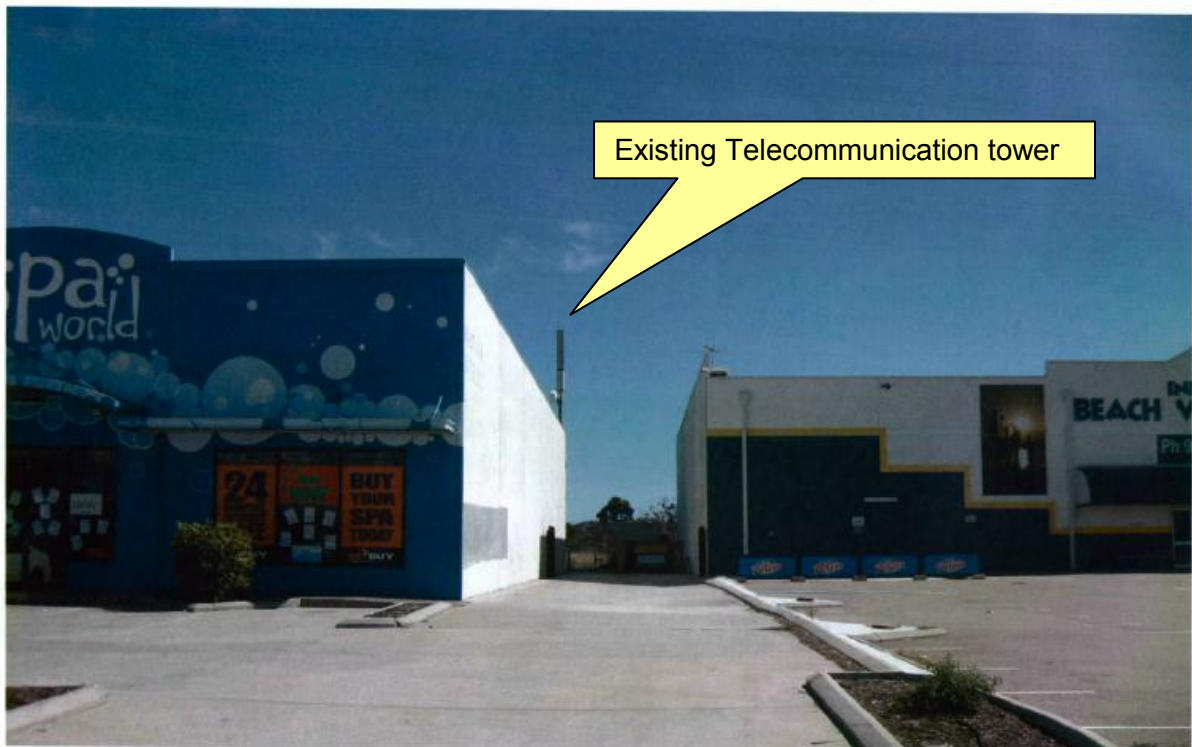
VIEW 1 – FROM WINTON ROAD LOOKING WEST, EXISTING BUILT FORM – LOT 83 (NO. 109) WINTON ROAD

DATE: 08.05.2013 DWG NO: 001 CONNOLLY TELCO SITE REV: A SCALE: 1:100