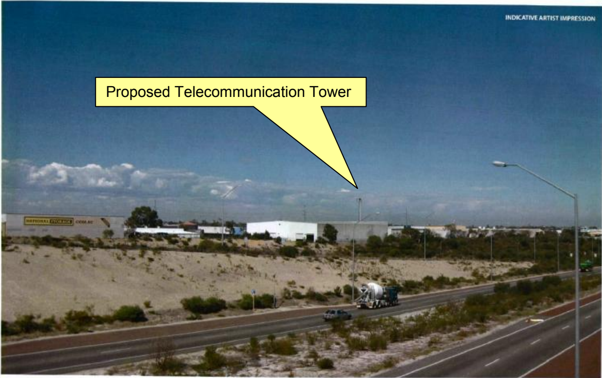
VIEW 3 – FROM NORTH BOUND FREEWAY EXIT TO SHENTON AVENUE, PROPOSED BUILT FORM

DATE 08.05.2013 DWG NO 306 CONNOLLY TELCO SITE REV A SCALE HTS