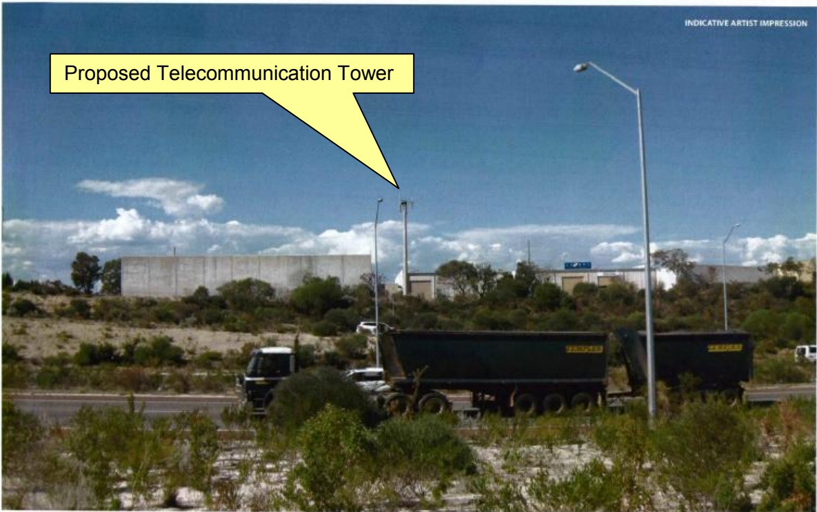
VIEW 4 – FROM WESTERN SIDE OF MITCHELL FREEWAY, ADJACENT TO RESIDENTIAL AREA, PROPOSED BUILT FORM

DATE 08.05.2013 DWG NO 306 CONNOLLY TELCO SITE REV A SCALE HTS