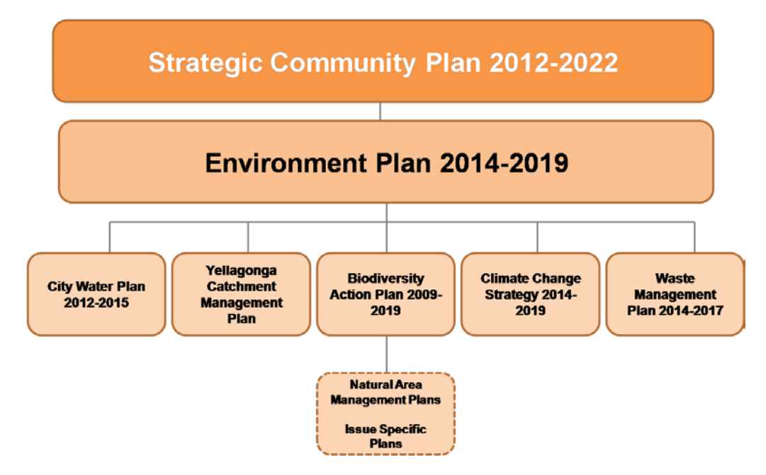
Figure 1- City of Joondalup Environmental Framework

Sitting below the draft Environment Plan 2014-2019 are a series of issue specific plans which address key environmental issues such as water conservation, climate change and adaptation and biodiversity conservation. These issue-specific plans contain detailed information on the activities that the City will take in addressing the key environmental issues affecting the local environment.